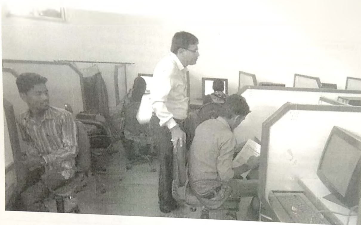
Glimpse of the RUSA Component 12