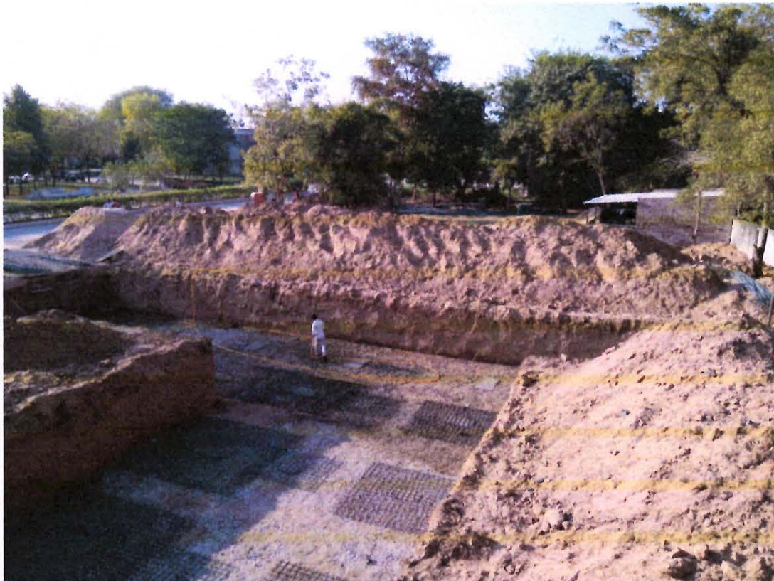
Extension of MBA Department from RUSA Grant.