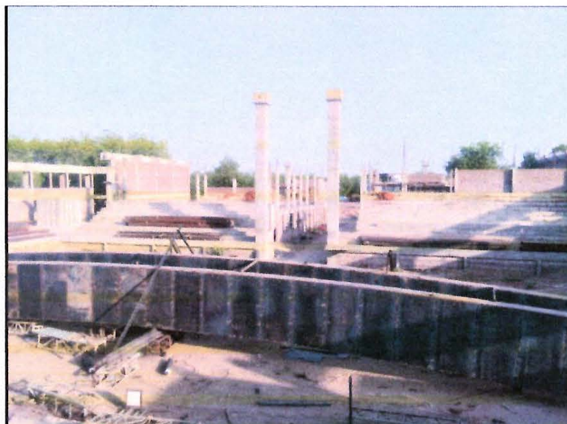
Construction of Sport Complex from RUSA Grant.