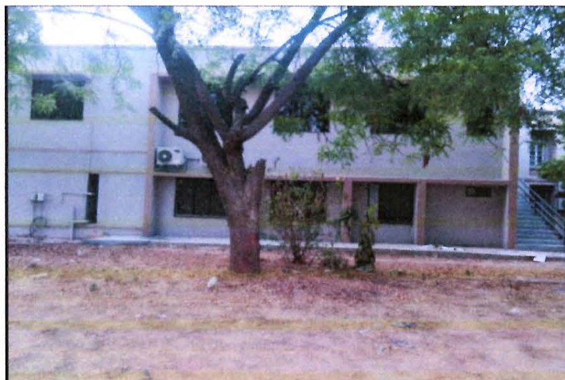
Extension of Administrative Building from RUSA Grant.