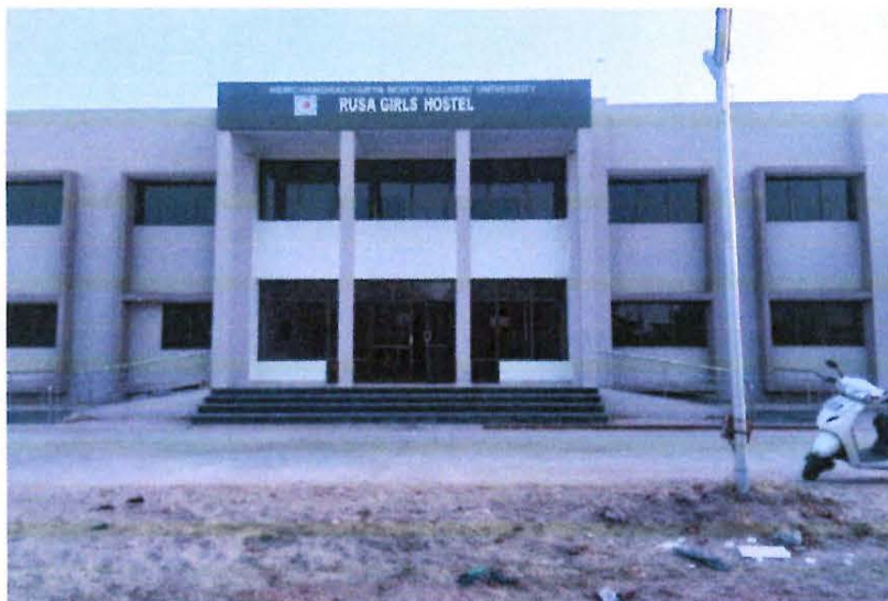
New Construction of Girls Hostel from RUSA Grant.