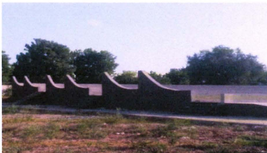
Construction of Amphi Theatre from RUSA Grant.