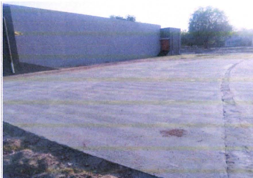
Construction of RCC Road Part-3 from RUSA Grant.