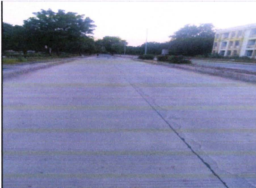
Resurfacing of RCC Road from RUSA Grant.