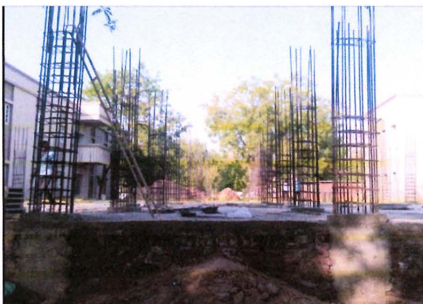
Construction of Laboratory for Dept. of Life Sciences from RUSA Grant.