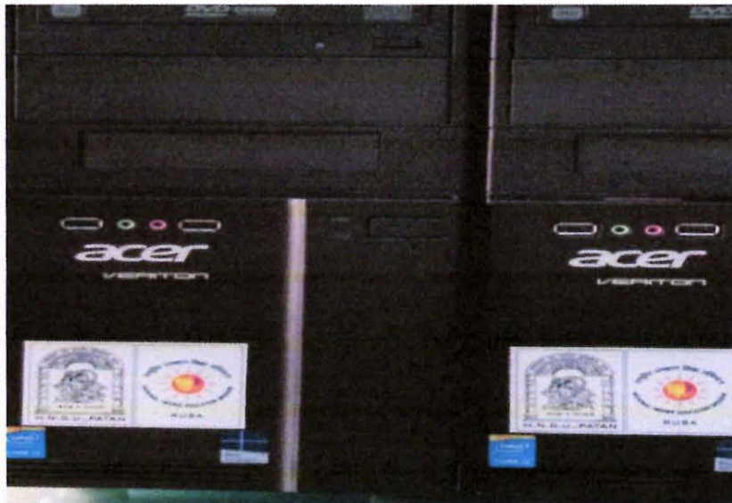
Computer Purchase from RUSA Grants.