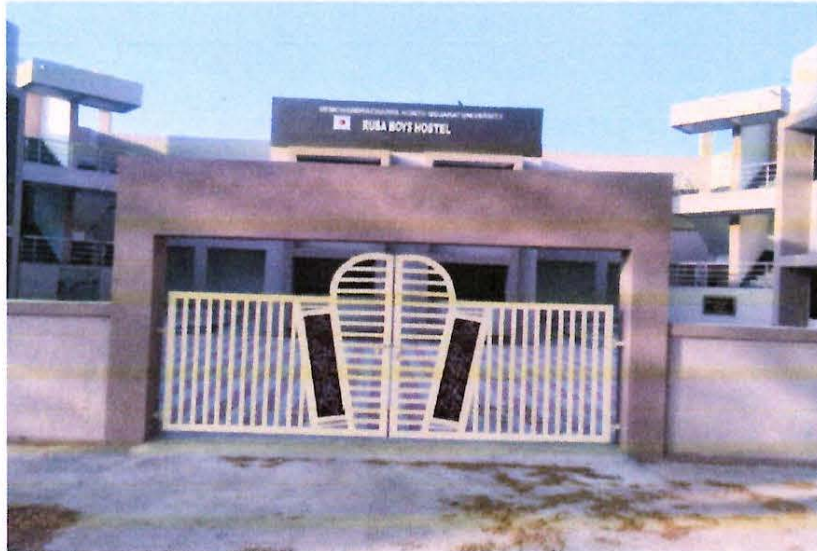
New Construction of Boys Hostel from RUSA Grant.