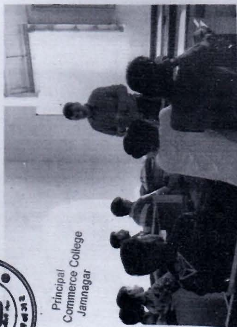
Principal Govt. Commerce College Jamnagar